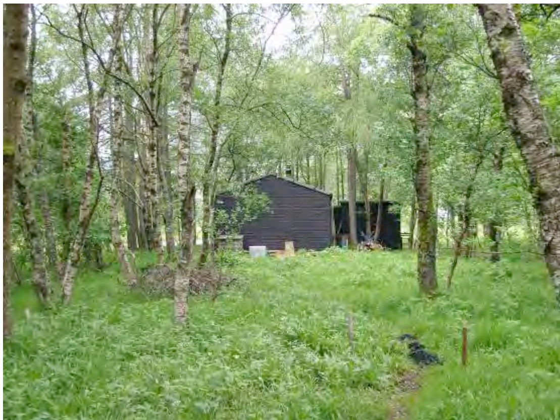
Figure. 2- Existing club hut.