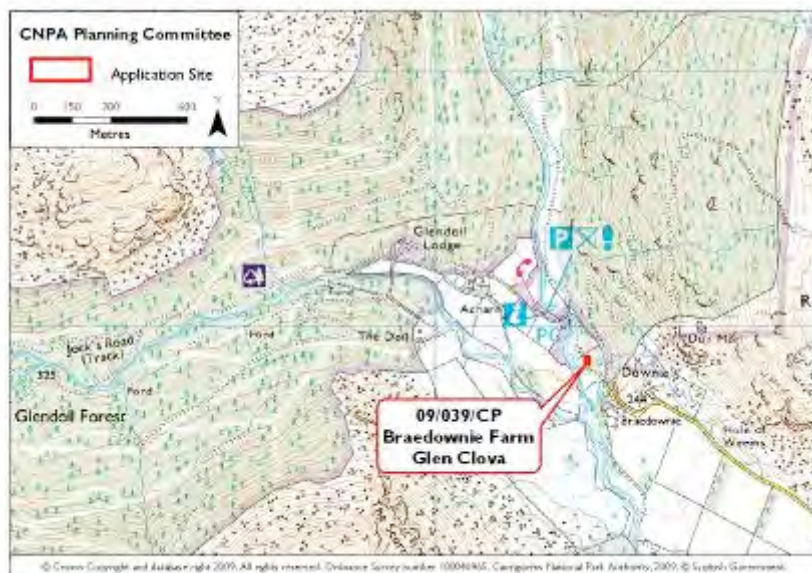
Fig. 1 - Location Plan