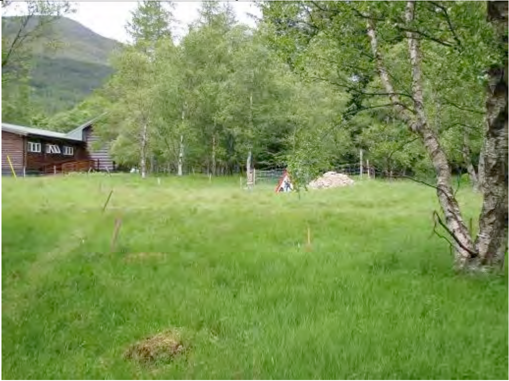
Fig. 4- View of pegged out site for hut with Scott Lodge in background.