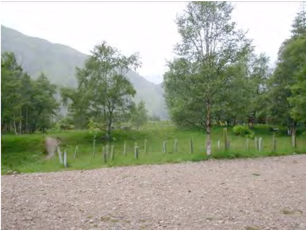
Fig. 3- View towards site from car park.